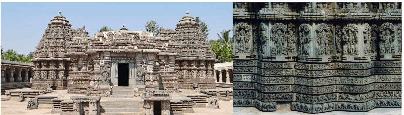
Chennakeshava Temple, India

The evidence of advanced technology in the past is everywhere in all countries on the earth and under the sea. But is this evidence of aliens from another planet bringing their tech to Earth or it is evidence of the science and technology of the antediluvian world that was lost in the flood?